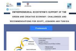
INVESTMED Infographic - Entrepreneurial Ecosystem's Support of the Green and Creative economy: challenges and recommendations for Egypt, Lebanon and Tunisia EMEA - 06.10.23