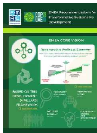
EMEA Recommendations for Transformative Sustainable Development EMEA - 10.12.23