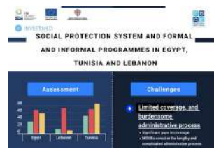
INVESTMED Infographic - Social Protection System and Formal and Information Programmes in Egypt, Lebanon, and Tunisia EMEA - 06.10.23