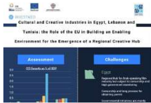
INVESTMED Infographic - Cultural and Creative Industries in Egypt, Lebanon and Tunisia: the role of the EU in building an enabling environment for the emergence of a regional creative hub EMEA - 06.10.23