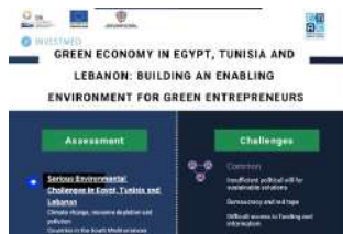
INVESTMED Infographic - Green Economy in Egypt, Tunisia and Lebanon: building an enabling Environment for green entrepreneurs EMEA - 06.10.23