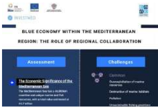
INVESTMED Infographic - Blue Economy within the Mediterranean Region: the role of regional collaboration EMEA - 06.10.23