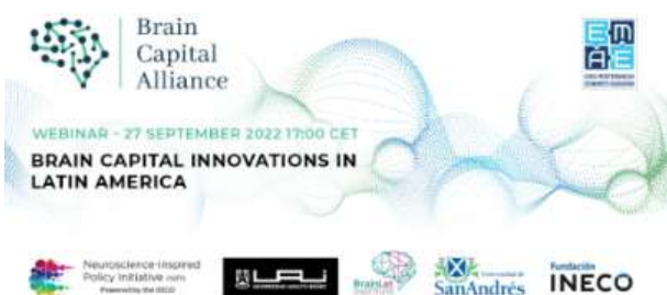
Brain capital innovations in Latin America Online - 27.09.22