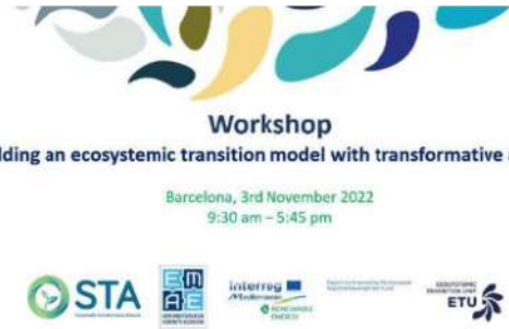
Workshop “Building an ecosystemic transition model with transformative actions” EMEA HQ - Barcelona, 03.11.22