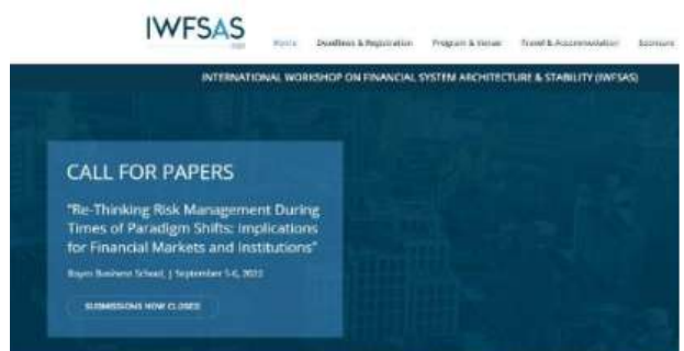
IWFSAS 2022 Bayes Business School - London, 05-06.09.22