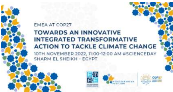
EMEA at COP27: Towards an innovative integrated transformative action to tackle climate change COP 27 Mediterranean Pavilion - Sharm el-Sheikh, Egypt - 10.11.22