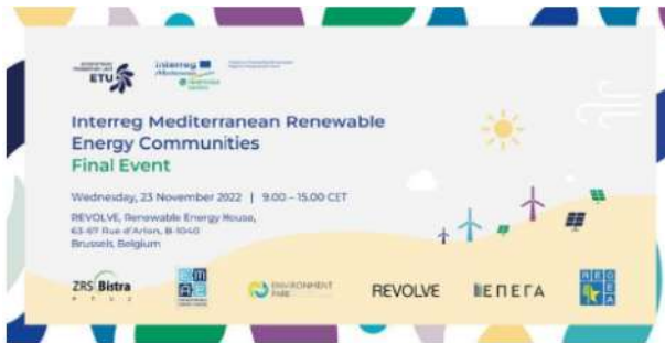
Interreg MED Renewable Energy Project – final event Renewable Energy House - Brussels, 23.11.22