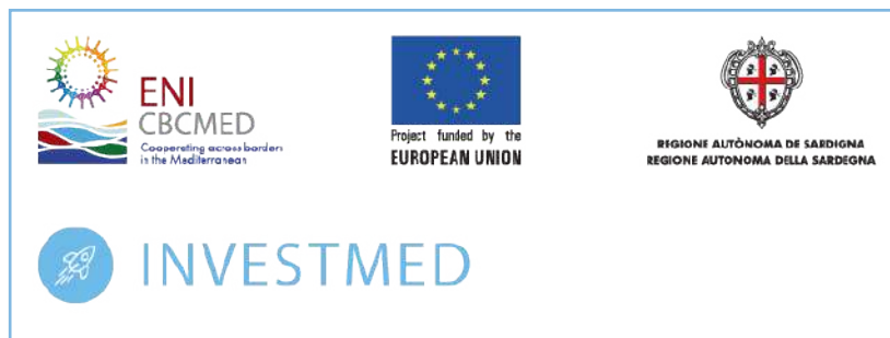
The 5th INVESTMED Newsletter announces the winning business proposals and other project progress INVESTMED - 09.12.22