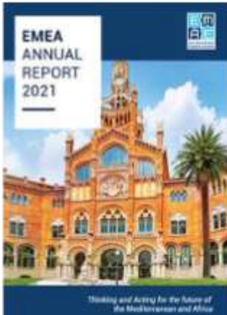
EMEA Annual Report 2021 EMEA - 21.09.22