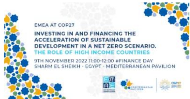
EMEA at COP27: Investing in and financing the acceleration of sustainable development in a net zero scenario – The role of high income countries COP 27 Mediterranean Pavilion - Sharm el-Sheikh, Egypt - 09.11.22