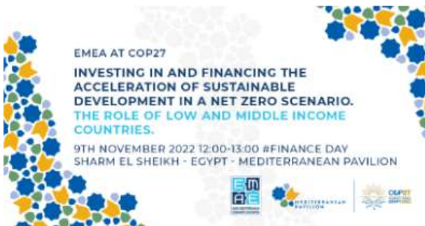
EMEA at COP27: Investing in and financing the acceleration of sustainable development in a net zero scenario – The role of low and middle income countries COP 27 Mediterranean Pavilion - Sharm el-Sheikh, Egypt - 09.11.22