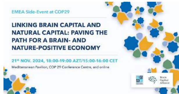
EMEA Side Event at COP29 – Linking Brain Capital and Natural Capital: Paving the Path for a Brain- and Nature-Positive Economy