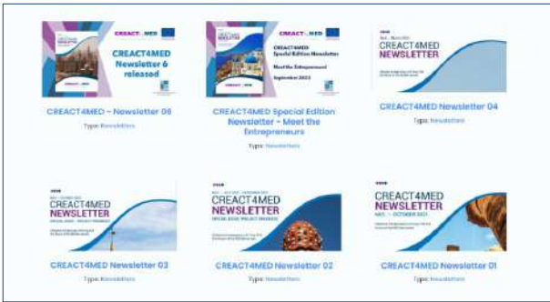
CREACT4MED Newsletters repository