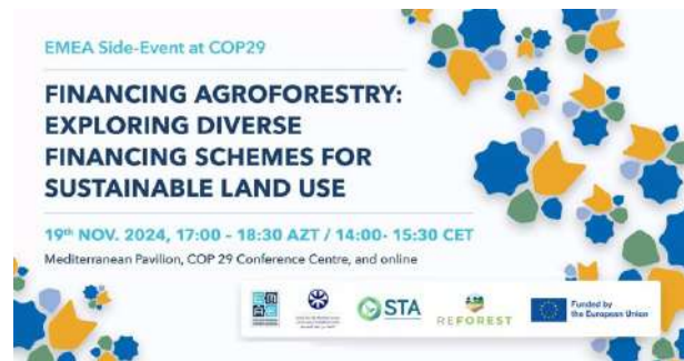
EMEA Side Event at COP29 – Financing Agroforestry: Exploring Diverse Financing Schemes for Sustainable Land Use