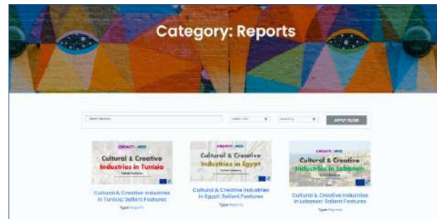
CREACT4MED Reports repository