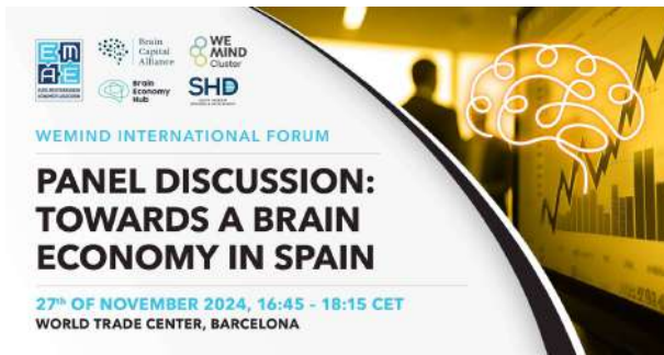
WeMind International Forum Panel Discussion: Towards a Brain Economy in Spain