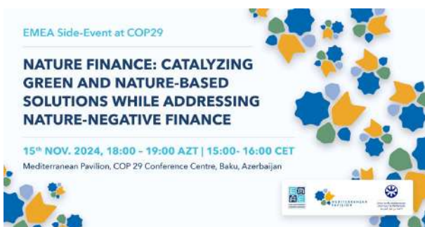
EMEA Side Event at COP29 – Nature Finance: Catalyzing Green and Nature-Based Solutions while Addressing Nature-Negative Finance