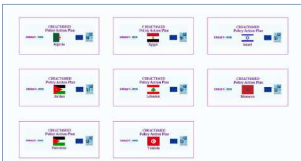
CREACT4MED Policy recommendations and country action plans repository