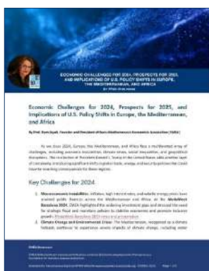
Economic Challenges for 2024, Prospects for 2025, and Implications of U.S. Policy Shifts in Europe, the Mediterranean, and Africa