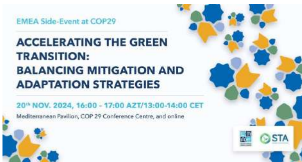
EMEA Side Event at COP29 – Accelerating the Green Transition: Balancing Mitigation and Adaptation Strategies