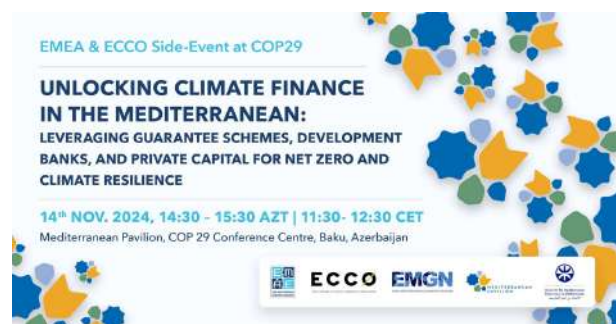
EMEA & ECCO Side Event at COP29 – Unlocking Climate Finance in the Mediterranean: Leveraging Guarantee Schemes, Development Banks, and Private Capital for Net Zero and Climate Resilience