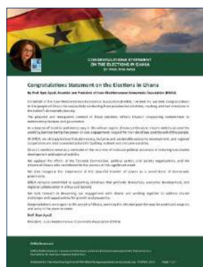
Congratulations Statement on the Elections in Ghana