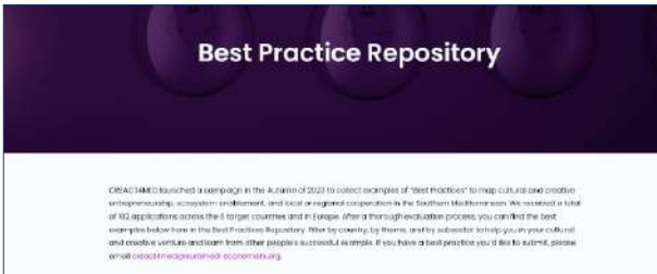
CREACT4MED Best Practices repository