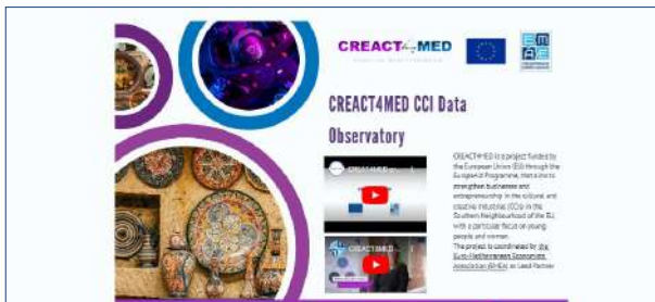
CREACT4MED CCI Observatory