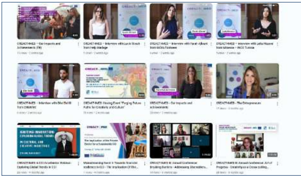
CREACT4MED YouTube Channel