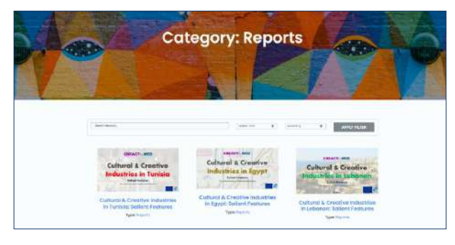
CREACT4MED Reports repository