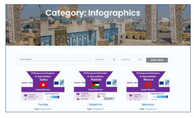
CREACT4MED Infographics repository

CREACT4MED Policy recommendations and country action plans repository