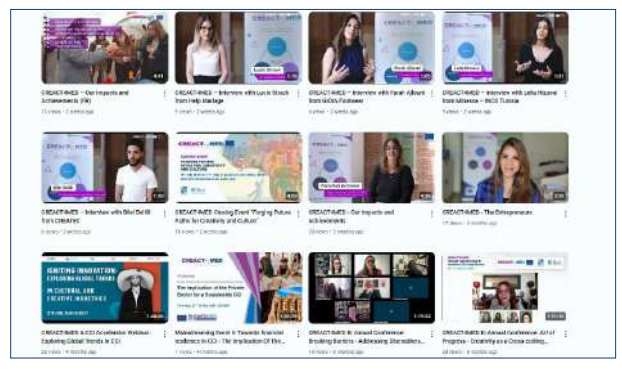
CREACT4MED YouTube Channel