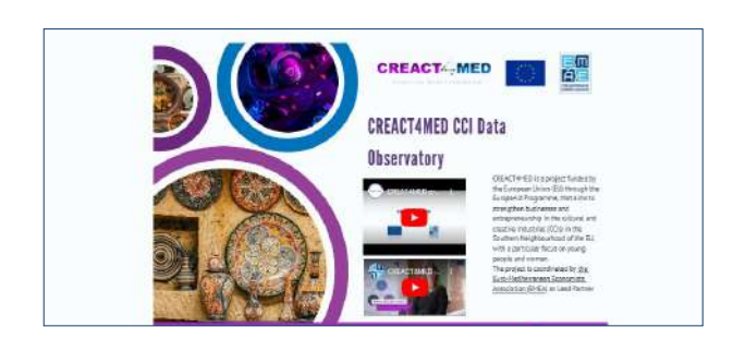
CREACT4MED CCI Observatory