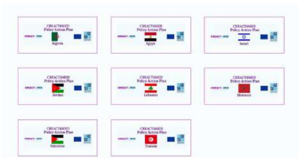
CREACT4MED Policy recommendations and country action plans repository