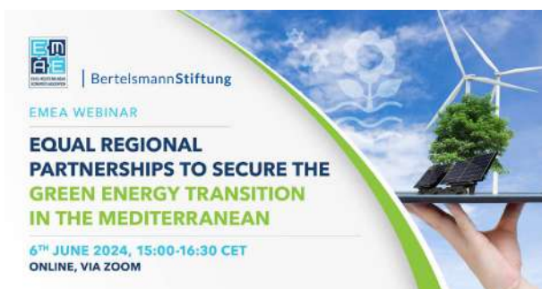
EMEA Webinar: Equal Regional Partnerships to Secure the Green Energy Transition in the Mediterranean