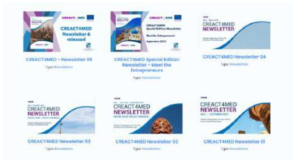
CREACT4MED Newsletters repository