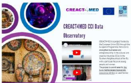
CREACT4MED CCI Observatory