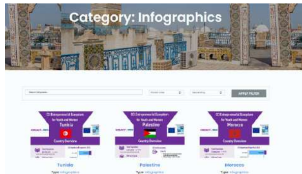
CREACT4MED Infographics repository