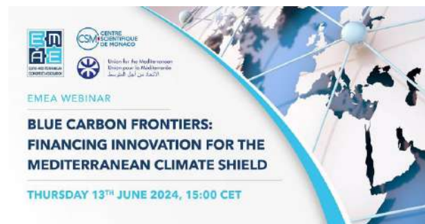
EMEA Webinar: Blue Carbon frontiers – Financing innovation for the Mediterranean climate shield