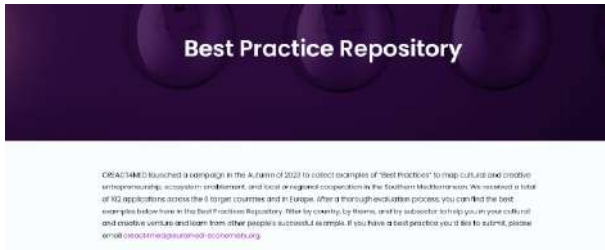
CREACT4MED Best Practices repository