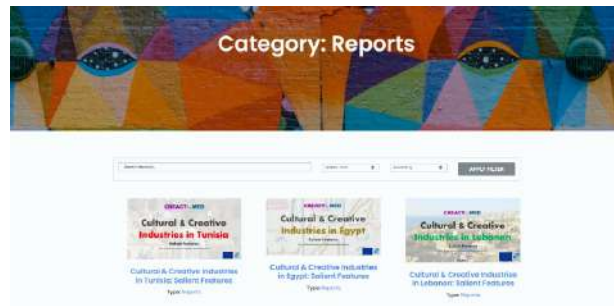
CREACT4MED Reports repository