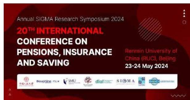
20th International Conference on Pension, Insurance and Saving

Renmin University of China – 23 & 24 May 2024