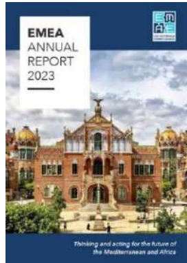
EMEA Annual Report 2023 EMEA - 27.08.24