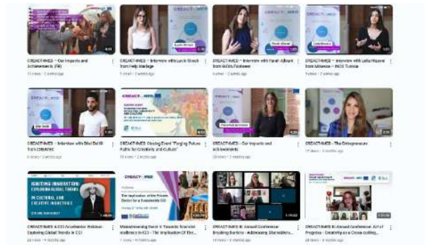
CREACT4MED YouTube Channel