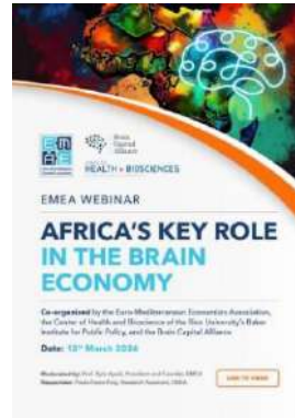
EMEA Webinar Report – Africa's Key Role in the Brain Economy EMEA - 05.06.24