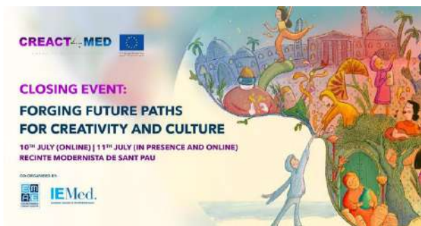
CREACT4MED Closing Event: Forging Future Paths For Creativity And Culture