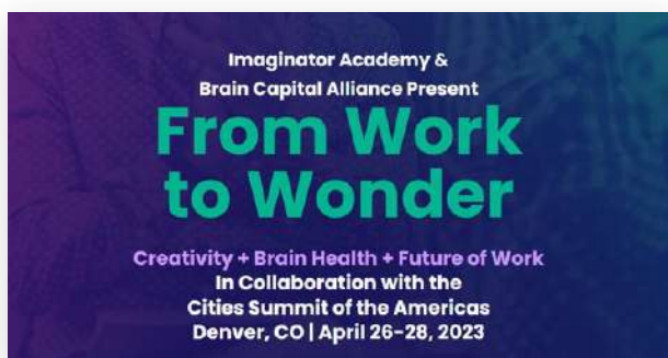
EMEA co-hosts Plenary Session on "Creativity & Brain Health in the Future of Work" at the Cities Summit of the Americas 2023 Cities Summit of the Americas and online - 28.04.23