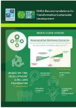
EMEA Recommendations for Transformative Sustainable Development EMEA, December 2023