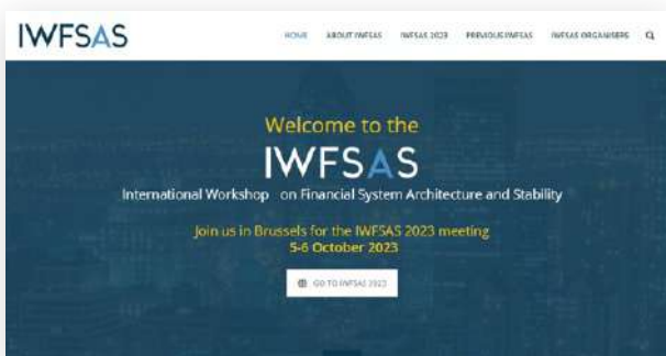
IWFSAS 2023 Brussels, 5-6.10.23