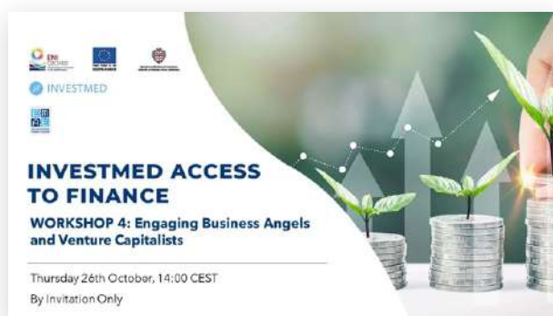
INVESTMED Workshop: Engaging Business Angels and Venture Capitalists Online - 26.10.23