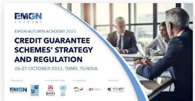
EMGN Autumn Academy 2023: Regulation and Greening Strategy Tunis, 26-27.10.23