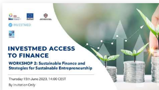
INVESTMED Workshop: Sustainable Finance and Sustainable Entrepreneurship Online - 15.06.23