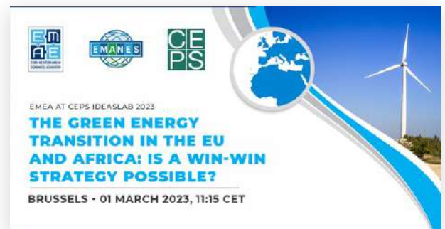
The Green Energy Transition in the EU and Africa: Is a win-win strategy possible? CEPS Ideas Lab, Brussels and online - 01.03.23