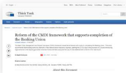
Reform of the CMDI framework that supports completion of the Banking Union Rym Ayadi et al., May 2023 Published by the EU Parliament Think Tank and prepared by the Economic Governance and EMU scrutiny Unit (EGOV) at the request of the Committee on Economic and Monetary Affairs (ECON)