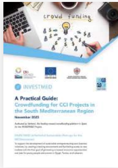
A Practical Guide: Crowdfunding for CCI Projects in the South Mediterranean Region Verkami for the INVESTMED project, November 2023