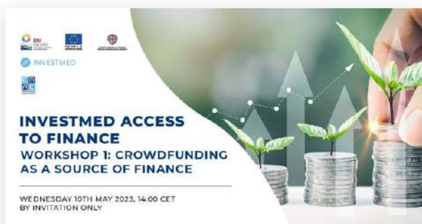
INVESTMED Workshop: Crowdfunding as a Source of Finance Online - 10.05.23

All INVESTMED workshops and the final advocacy session are available to watch on the INVESTMED Youtube . The workshop report is available on the EMEA website here .