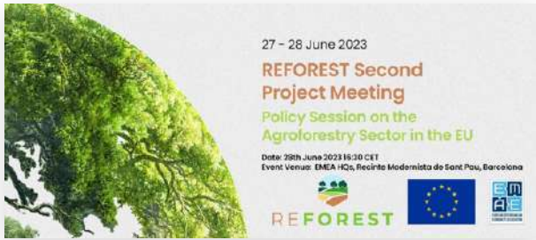
REFOREST second Project Meeting and Policy Session on the Agroforestry sector in the EU EMEA HQ and online - 27-28.06.23