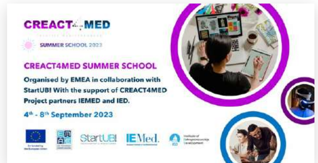
CREACT4MED Summer School Barcelona, Start UB! HQ - September 2023