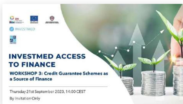
INVESTMED Workshop: Credit Guarantee Schemes for MSMEs Online - 21.09.23